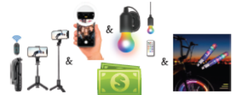
$1,000+ Total Sales Let Your Magic Shine Kit (Selfie Stick, Ring Light, Color Changing Light, LED Bike Lights) AND Council Cash

Council Cash may be used for GSNI-M store purchases, camp, event fees and GSUSA membership