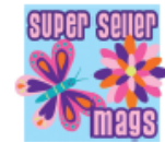
5+ Magazine Items Super Seller Mags Patch