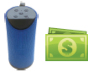
$700+ Total Sales Bluetooth Tower Speaker AND Council Cash