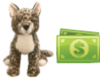
$600+ Total Sales Large Ocelot Plush AND Council Cash