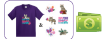
$500+ Total Sales Own Your Magic T-Shirt & Theme Stickers AND Council Cash