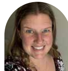
Coral Outdoor Program Coordinator