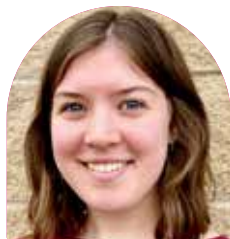
Maple Camp Experience Manager

Whether you're a first-time pathfinder or a repeat trailblazer, you're sure to have an unforgettable experience. Get ready to discover your next adventure!