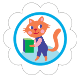
Cookie Goal Setter