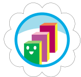
My First Cookie Business

Earn one of the Cookie Business badges to help you discover new skills. Each badge has digital marketing skills built right in.