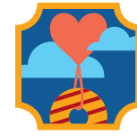
My Cookie Business Resume