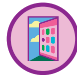
My Cookie Team