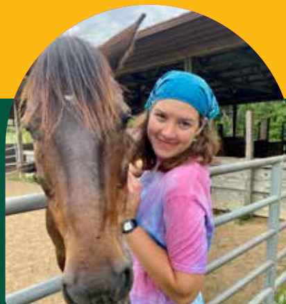
Maple Camp Experience Manager GSNI-M